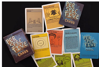
The Perspective Cards