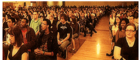
Every seat was filled; students had to stand in the back and along the side walls.