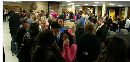
A line began forming for entrance to The Maze over an hour before the event started.

We have greatly enjoyed reaching UNC with the good news of Jesus this year and are so thankful for your prayers and support to make it all possible.